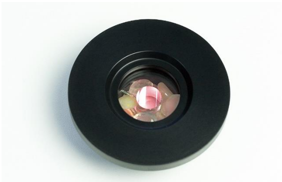
Figure 2 Rose Quartz gemcup

For medical feedback and inspiration our website displays statements from medical specialists and their patients as they express their wellbeing in their own words. Visit www.medicahhealth.org for general more information.